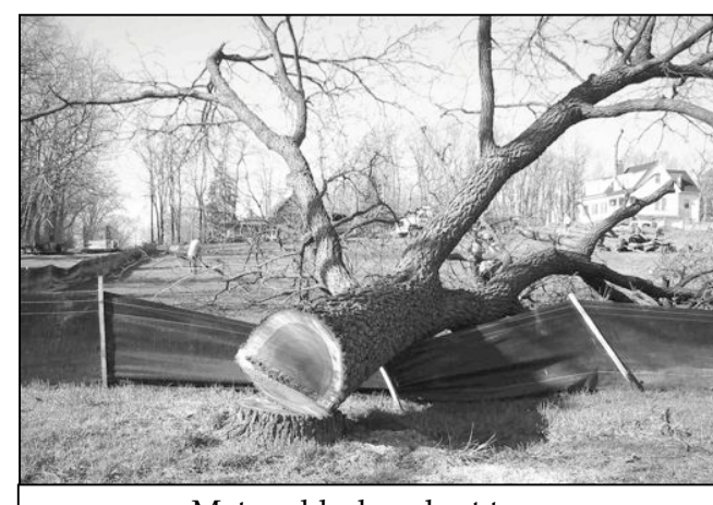
Mature black walnut tree

The neighborhood residents adjoining the proposed "Nelson Meadow" subdivision have organized their efforts, compiled constructive recommendations for the Village of Downers Grove, and testified at the Plan Commission hearing concerning a number of aspects that threaten the existing character of the neighborhood.