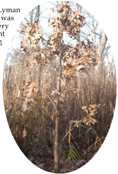
Bill Runyon's White Oak

Visit the Natural Areas page at www.dgparks.org or contact the Interpretive Center, at 630.963.1304 for information and rules. – By Shannon Forsythe