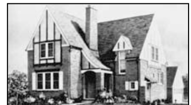
Elmhurst Model Sears Home