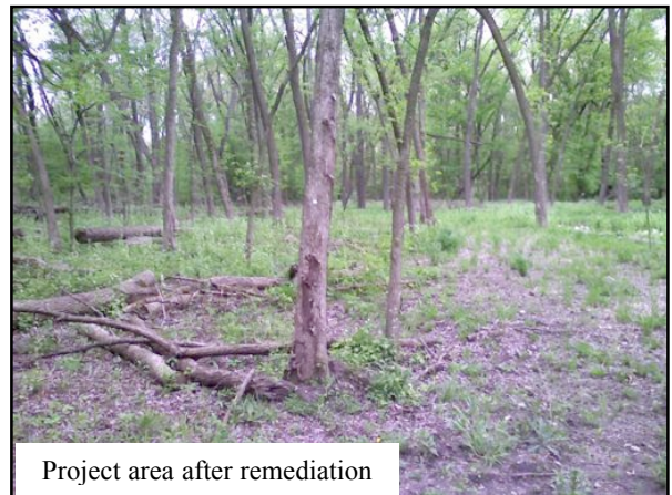
Project area after remediation