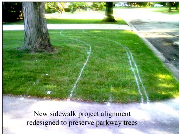
New sidewalk project alignment redesigned to preserve parkway trees