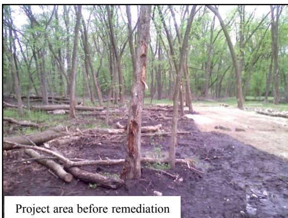
Project area before remediation