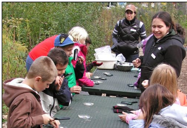
Little Sprouts learn about Coats and Cotyledons.

In the Chicago region and across the country, formal initiatives have burgeoned in recent years to encourage children to spend more time outdoors (for example, see Last Child in the Woods: Saving Our Children From Nature-Deficit Disorder by Richard Louv) and to promote the integration of environmental education into our educational system. The Little Sprouts program supports this important movement's goal to foster a generation of children who care enough for nature to understand and protect it. The program won the Illinois Park and Recreation Association's Outstanding Conservation Program Award for 2005 in recognition of achievements in environmental education and the promotion of conservation. Supporting the award-winning Little Sprouts program is one way the Downers Grove community is showing its dedication to developing the next generation of stewards.