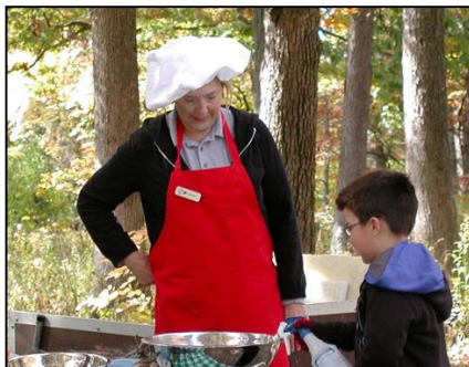
"Now add some water," says Chef Soil-ar-dee.

The Little Sprouts initiative was developed in 2003 by the Downers Grove Park District in partnership with Downers Grove School District 58 to provide an outdoor hands-on experience with plants and soil to complement the district's first grade science curriculum. For several years, PDHA has provided direct financial support for this program and its educational mission. Other supporters of the program include The Grove Foundation, The Education Foundation, and the Illinois Department of Natural Resources.