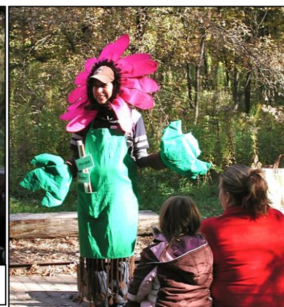
Finally, the Cone Flower blooms.