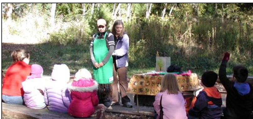
Mom sprouts as a Cone Flower in our Flower Fashion Show.