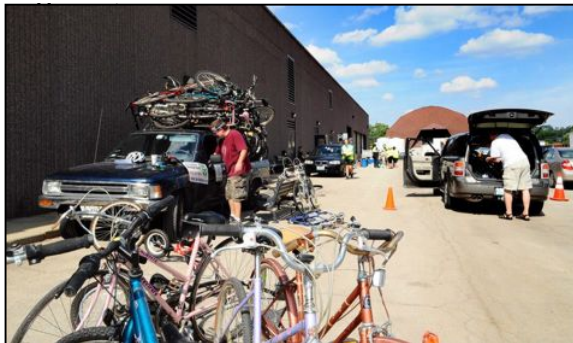
Bicycles collected by Working Bikes – most destined to be fixed up and reused