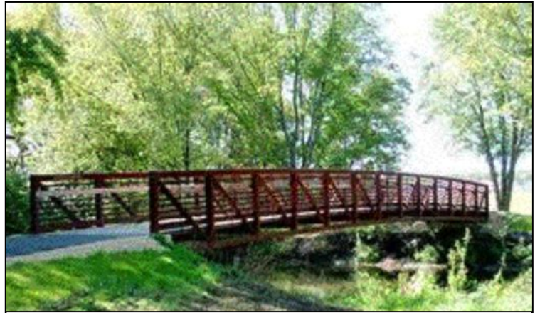
Bike trail truss bridge with an open grated deck

The DuPage County Division of Transportation is nearing the completion of preliminary engineering for its bikeway project along the 31 st Street corridor. This route will pass immediately adjacent to the north side of the Lyman Woods Preserve and provide access to the William F. Sherman, Jr. Interpretive Center. Federal approval to proceed with the