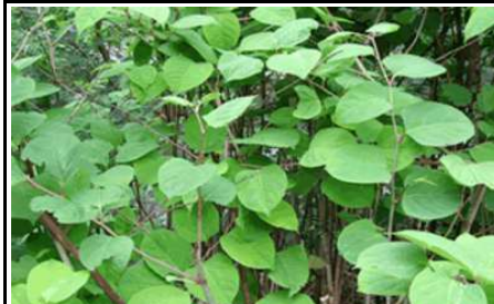
Japanese knotweed prior to application

Japanese knotweed in your backyard, waiver forms are provided on our website, www.PDHA.org , to help in this endeavor, along with Fact Sheets describing Japanese knotweed, and another invasive plant, Japanese stiltgrass ( Microstegium vimineum ). Funding is limited and was exhausted this year. Any new waivers will be added to a waiting list for next year.