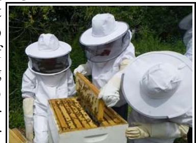
Junior beekeeping campers

“Having an apiary here has proved to be very worthwhile. Our first 6 week Beginner Beekeeping Course that we ran this past winter was full and most participants went on to successfully begin colonies of their own. The Junior Beekeeping Camp that took place in July was a big hit. We have also been able to take a few of our bees on the road with our portable observation hive. We did a beekeeping outreach for all the Downers Grove preschool classes last spring.