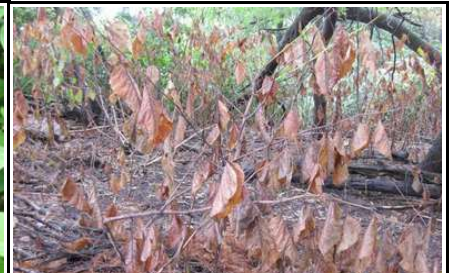
Japanese knotweed after two applications of herbicide