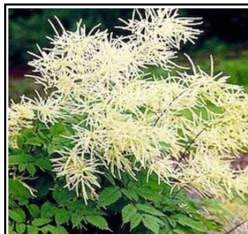
Goat's beard (Aruncus dioicus) as a native alternative

Thank you to those homeowners who participated in the program. Initial efforts were a success, both in participation and in starting to eradicate Japanese knotweed!