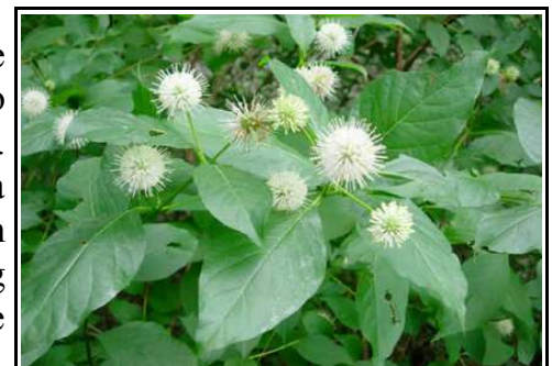
Buttonbush (Cephalanthus occidentalis) as a native alternative

Thank you to those homeowners who participated in the program. Initial efforts were a success, both in participation and in starting to eradicate Japanese knotweed!