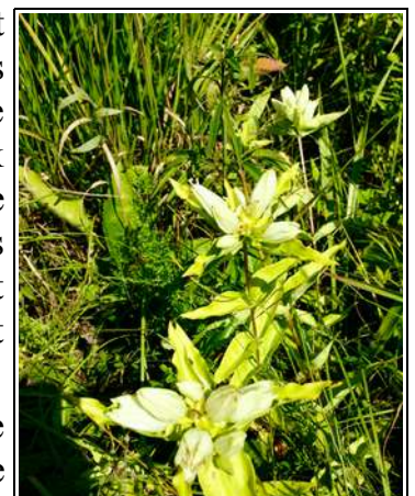
Striped Gentian ( Gentiana villosa )

Formed after glaciers retreated from the Chicago area, some 15000 years ago, and after the region underwent an extensive hotter and drier period, the prairie contains many species of grasses and forbs, some of them rare. Hikers witnessed bees disappearing in the clasping flower petals of gentians to collect pollen and nectar. The purple flowers of Blazing Star were in full bloom, against a tall backdrop of Big Bluestem and Indian Grass.