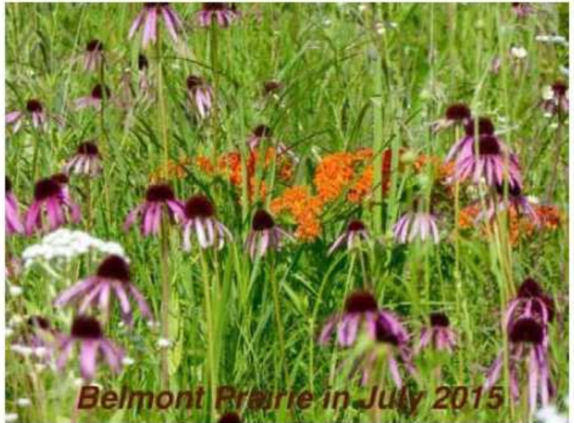
Belmont Prairie in July 2015