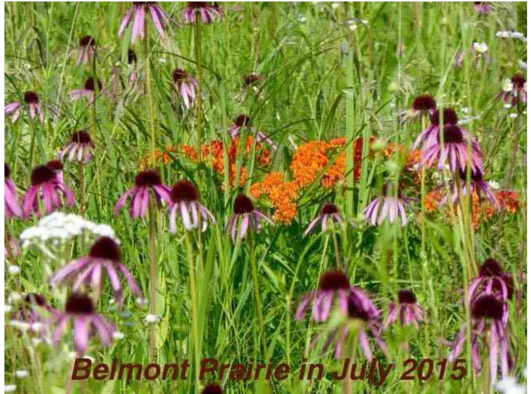
Belmont Prairie in July 2015

>> Work with Village, Park District and Forest Preserve District to encourage open space, native plantings, nature-oriented programs, and sound management of our natural resources.