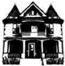
Friends of the Edwards House