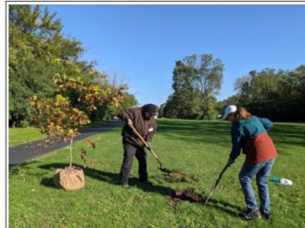
Tree Planting in Hoopers Hollow, October 2021

anniversary by planting 75 trees in two parks, Hoopers Hollow and O'Brien Park. PDHA is proud to support this effort by sponsoring one of these trees. - Ken Lerner