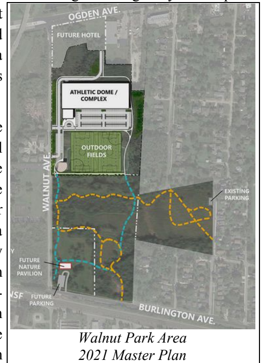
Walnut Park Area 2021 Master Plan

The plan is to have active recreational facilities in the northern portion of the park with outdoor soccer fields and a domed indoor facility together with passive/nature recreation in the southern portion. Plans for the southern portion