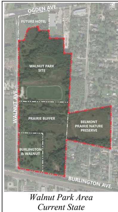
Walnut Park Area Current State

The Downers Grove Park District is planning for development of its Walnut Park Site along Walnut Avenue between Burlington Avenue and Ogden Avenue. The Belmont Prairie Nature Preserve is a little to the southeast with its protective Prairie Buffer directly south of the Walnut Park Site. Belmont Prairie is a rare, 10-acre remnant of the region's originally wide-spread