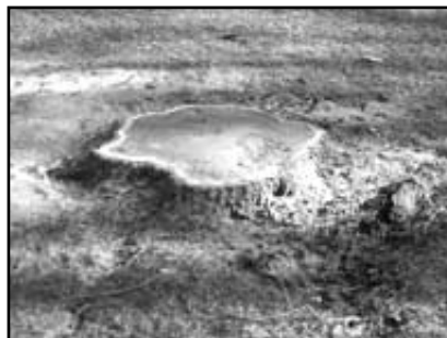
Mature trees are one of Downers Grove's most valuable resources.

The staff proposal would increase protection for both publicly and privately owned trees. During redevelopment projects, parkway trees would be better protected, and the builder would be required to submit a survey of existing trees on the lot and a plan for protection of larger trees. The staff proposal would increase substantially fines for the injury or unauthorized removal of trees identified for protection.