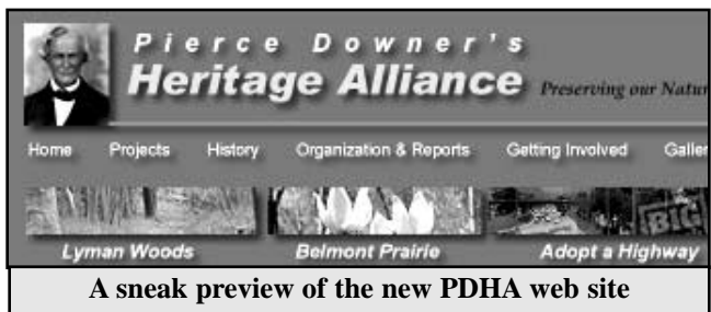
A sneak preview of the new PDHA web site