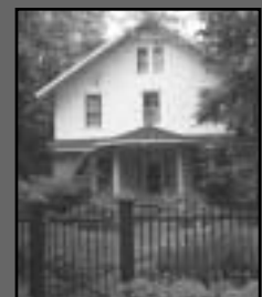
The Reverend Orange Lyman house on Maple Avenue.

The next meeting of the Heritage Alliance will be held on June 29, 2005 at 7 PM in Room 503 at Lincoln Center, 935 Maple Avenue in Downers Grove . Please plan to come and join in our work.