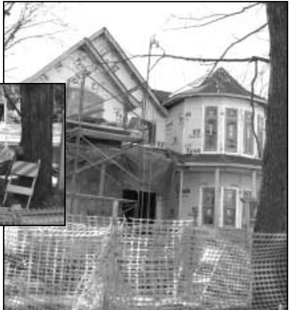
Construction damage causes significant damage to trees, which often do not survive.

In response to the Community Dialogue, Downers Grove Village Staff recommended steps to strengthen the Village's Tree Protection Ordinance. ( http://www.downers.us/govt/packets/03-08-05/tree%20preserve.pdf and http://www.downers.us/govt/packets/04-05-05/trees.pdf ) The Village's Environmental Concerns Commission endorsed the proposed changes in March. Twice now the Village Council has tabled consideration of these proposed changes. Currently, the Council plans to discuss these issues at its Workshop Meeting on May 10th.